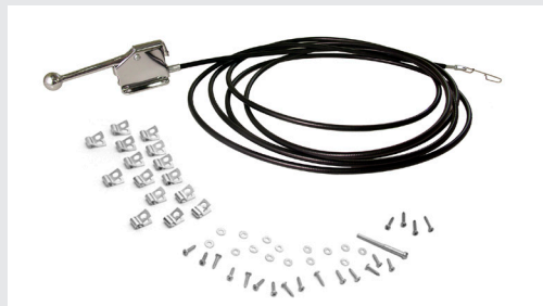
Cable Trunk Release Kit

CAUTION: Avoid sharp bends in the cable during routing. Use gentle sweeping bends so that the cable is not restricted inside the housing. The cable should not obstruct the rear seat.